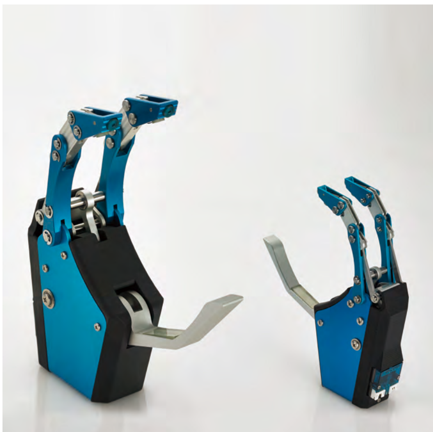
Large Type TRX-L